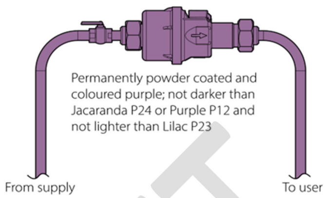
Figure 1 — Non-drinking water meter assembly

(viii) Non-drinking water infrastructure pipework shall be constructed using pipe materials and pressure class specifications equivalent to those prescribed for drinking water systems. For detailed requirements, refer to WSA-03-2011, Water Supply Code of Australia and the relevant Product Specifications.