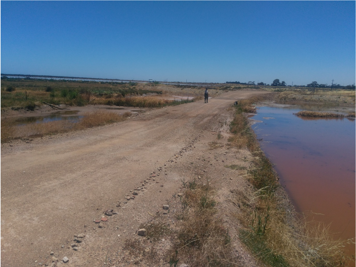
Photo 1: Little Para River area, looking North towards pond PA11, 3 December 2020.