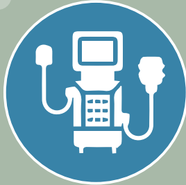
Intermittent Peritoneal Dialysis machine