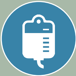
Kidney dialysis machine