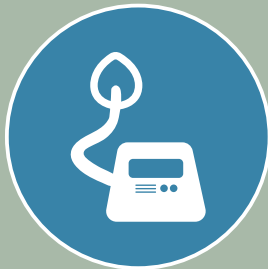
Chronic positive airways pressure respirator (CPAP)