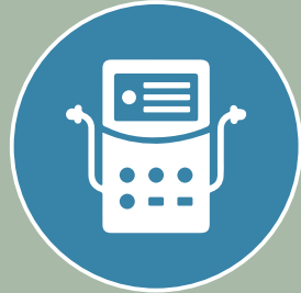
Ventilator for Life Support