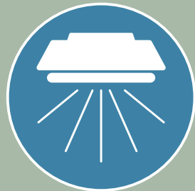
Crigler Najjar syndrome phototherapy equipment

Tjinguru nyuntu machine nyanga palunya tjananya kanyirampa Cowell Electric-pangka tjakultjura.