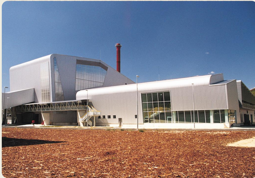
Acciona's 25 MW Sanguesa Biomass Plant, Navarra, Spain